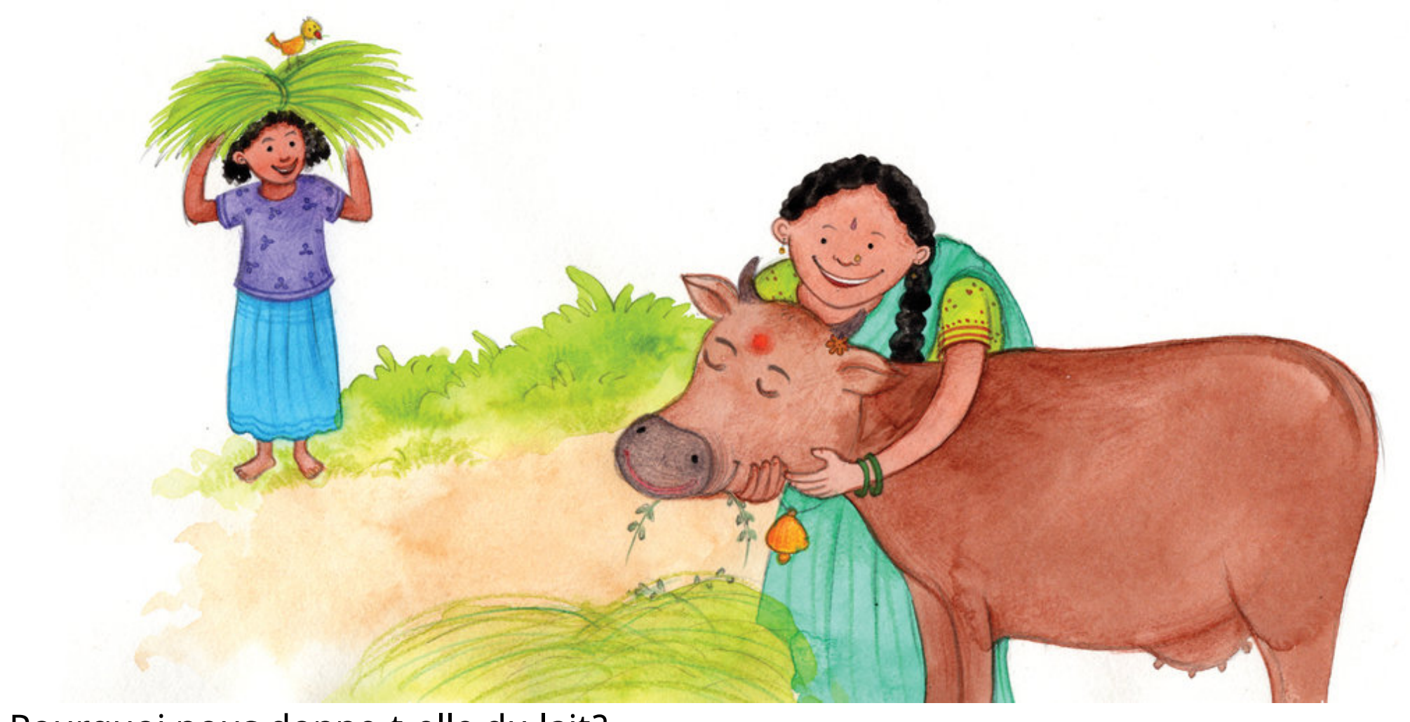
«Pourquoi nous donne-t-elle du lait?

"Nous lui donnons de l'herbe et beaucoup d'amour."