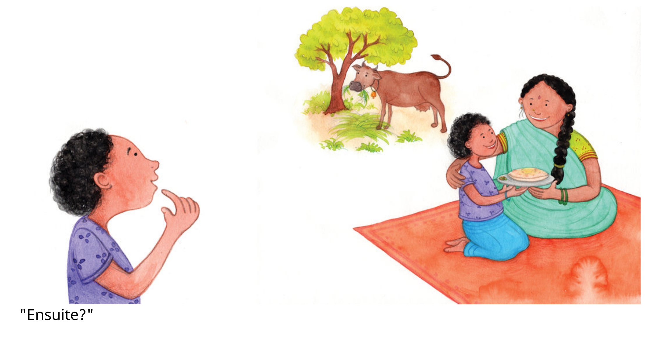
"Nous obtenons du lait et vous obtenez du ghee qui est pur et frais."