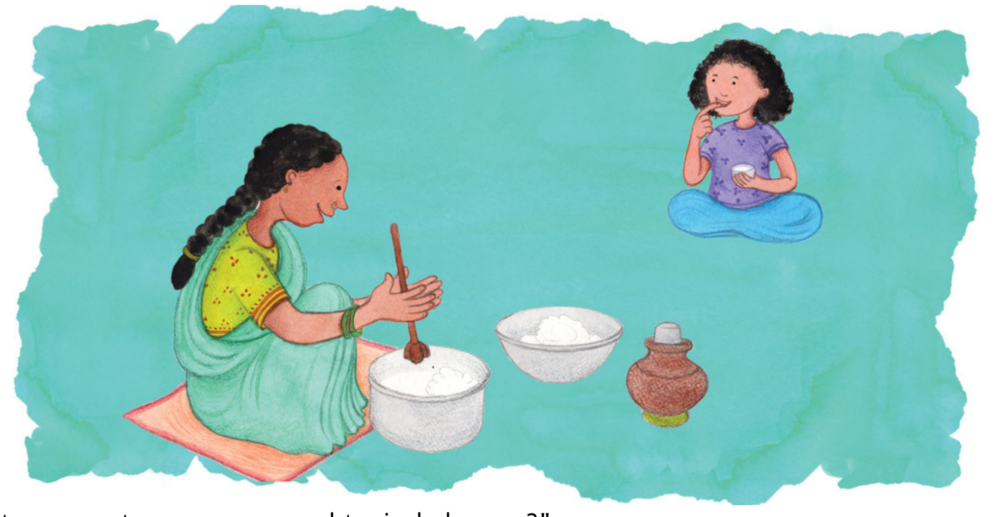
"Et comment pouvons-nous obtenir du beurre?"