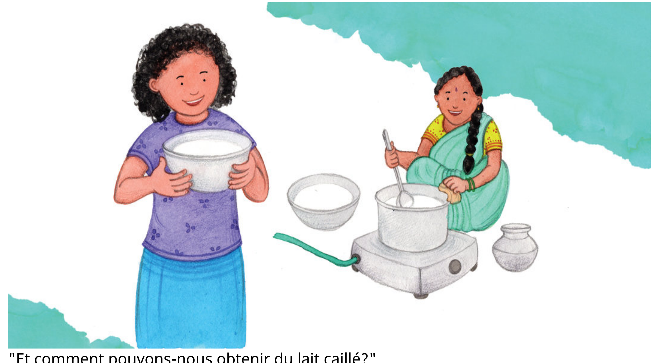
"Et comment pouvons-nous obtenir du lait caillé?"