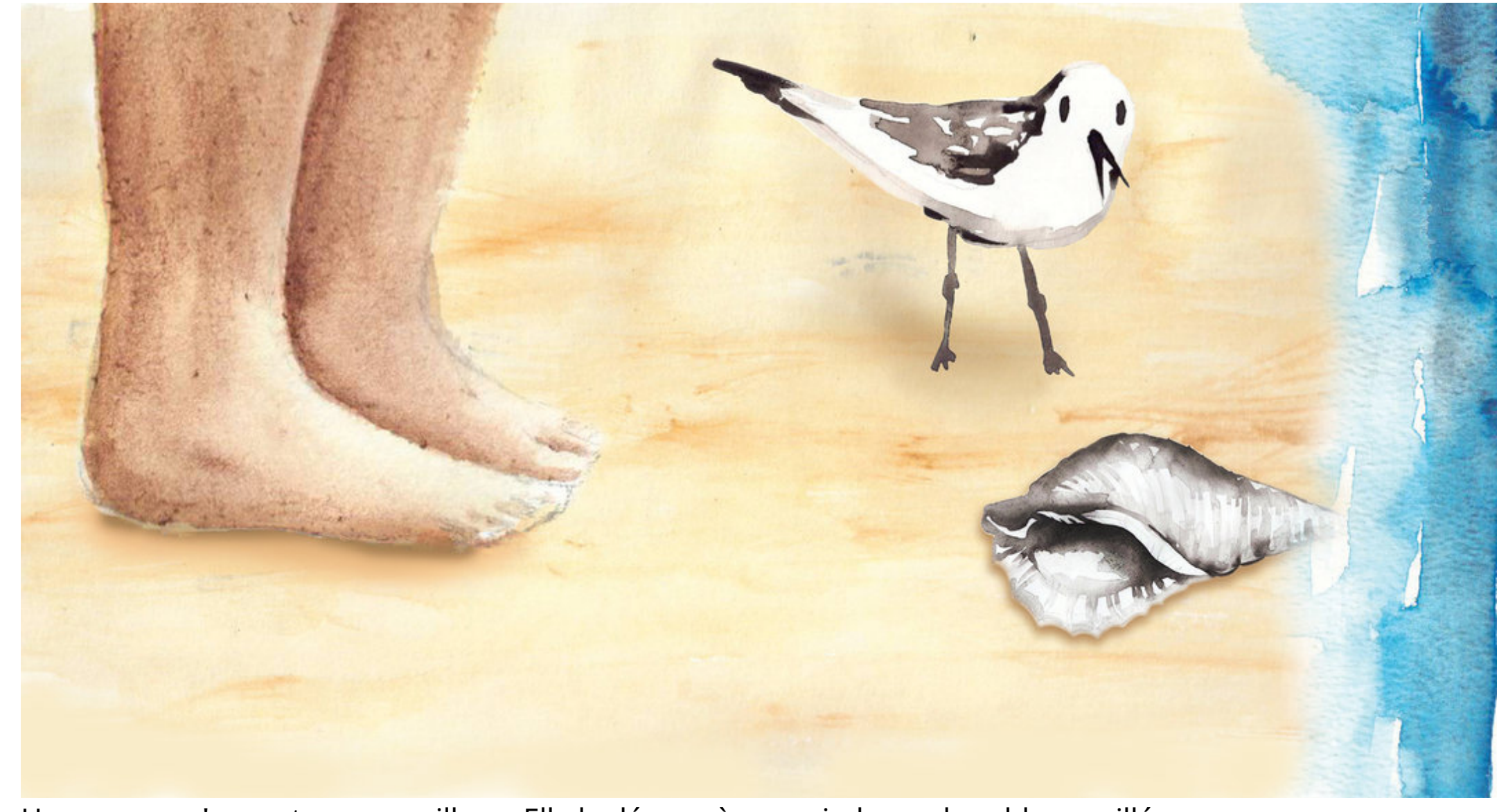
Une vague m'apporte un coquillage. Elle le dépose à mes pieds, sur le sable mouillé.