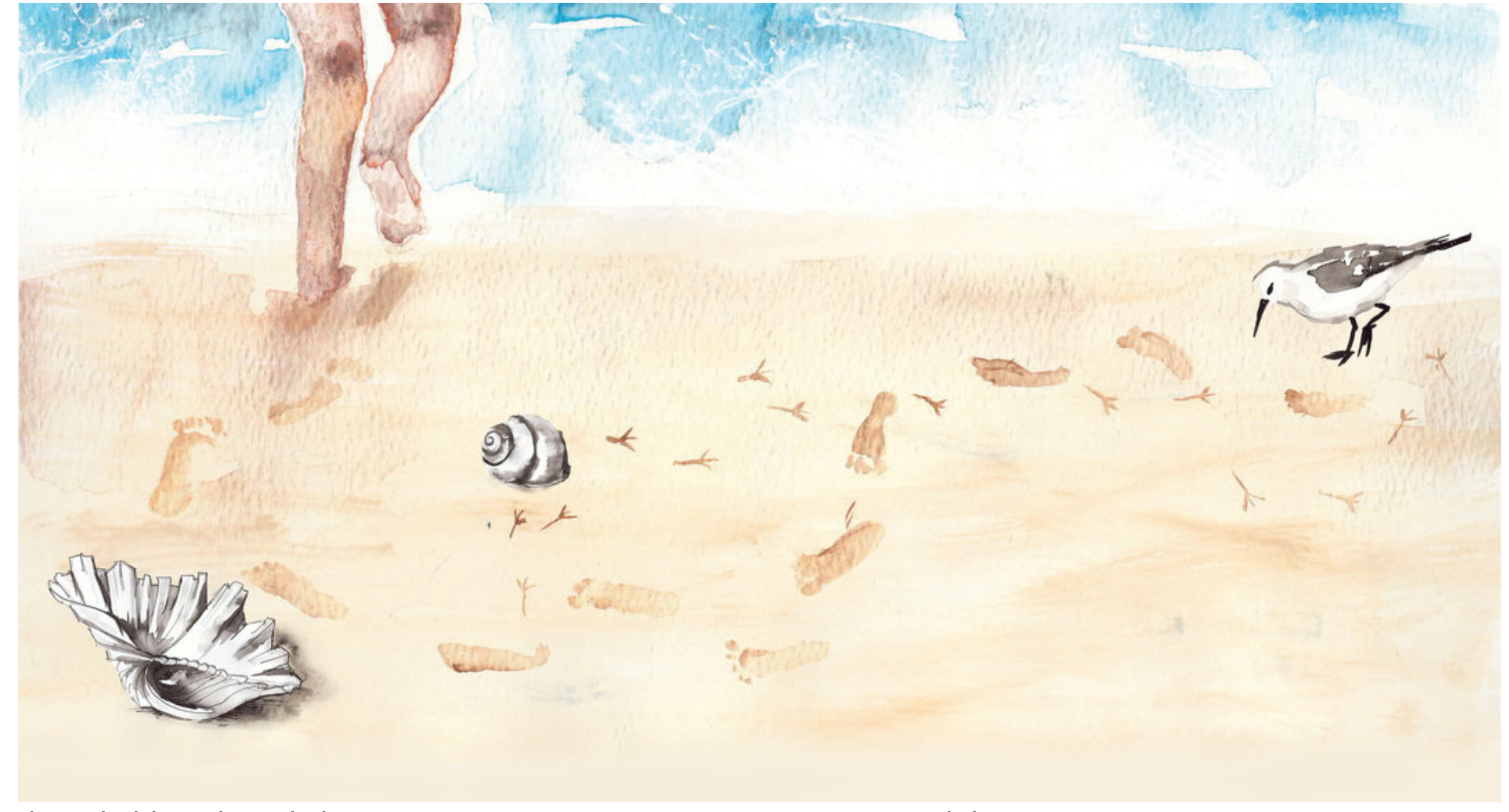
Il y a du bleu. Il y a de l'eau. Dans ce jeu, je ne peux pas rester immobile.