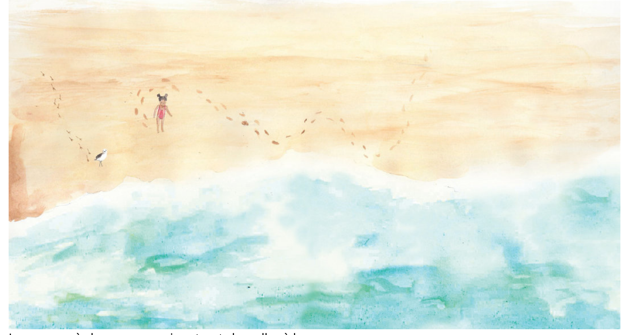
Je cours après les vagues, qui rentrent chez elles à la mer.