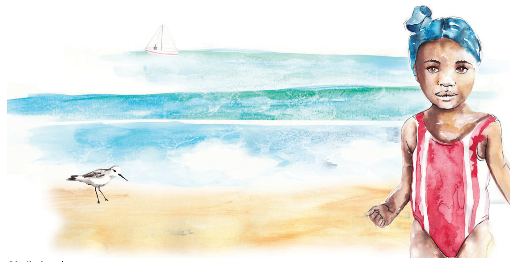
Oh, j'adore la mer.