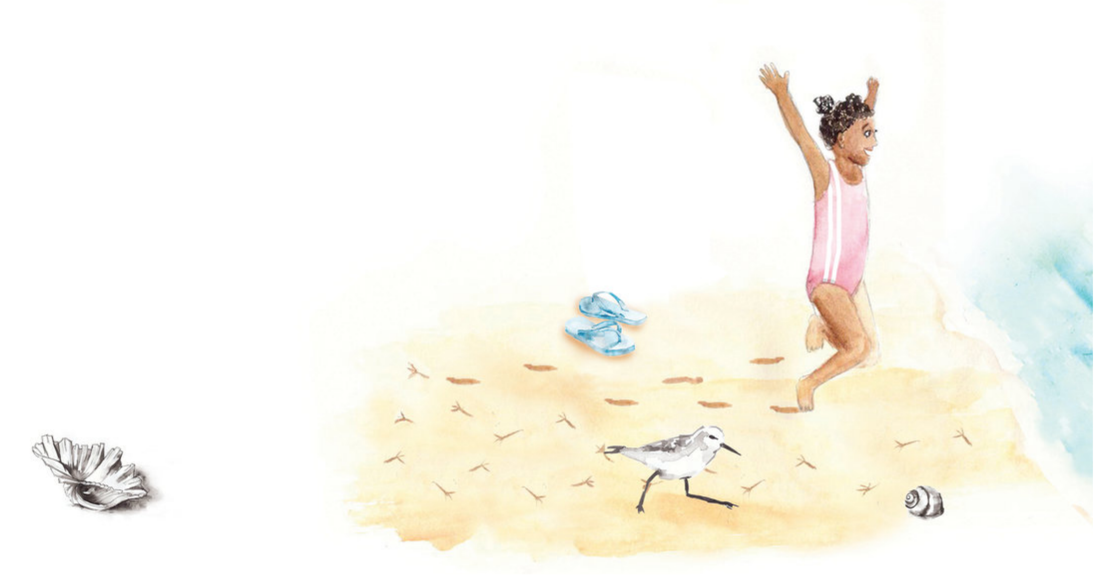
Elles disent non, et je dis oui. Je retourne en courant, au bord du sable, au bord de l'eau.