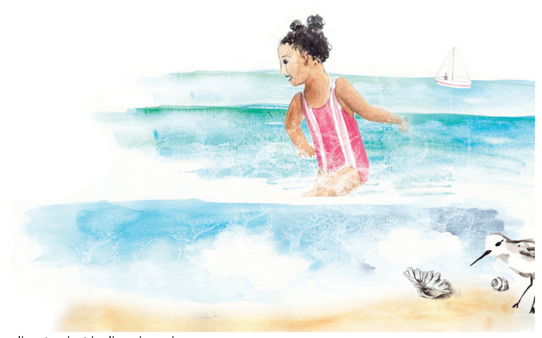
Et puis les vagues disent oui, et je dis oui aussi.