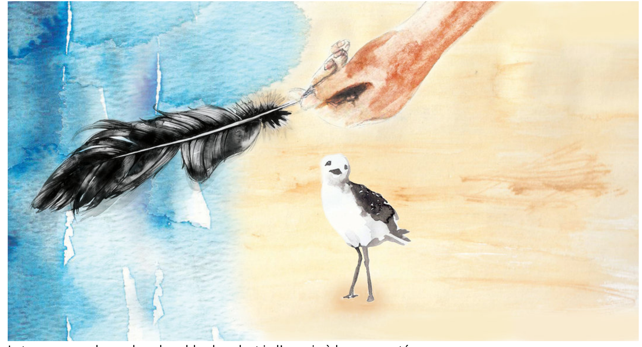
Je trouve une plume dans le sable chaud, et je l'envoie à la mer, portée par une vague.