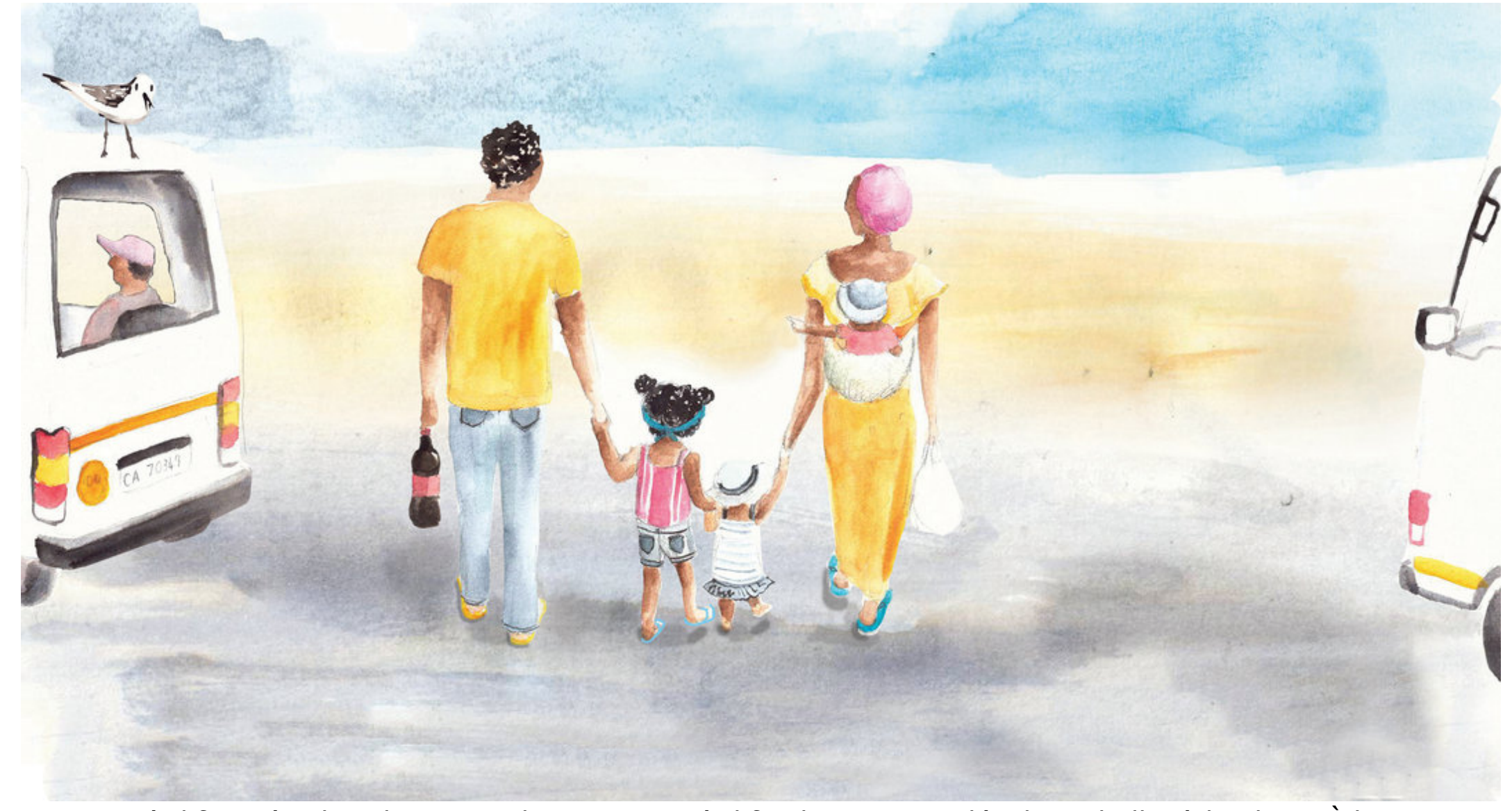
Un jour où il fait très chaud, un jour de vacances où il fait beau, nous décidons d'aller à la plage. À la mer !!! Nous allons à la mer, mon père, ma mère, mon frère, ma soeur et moi.