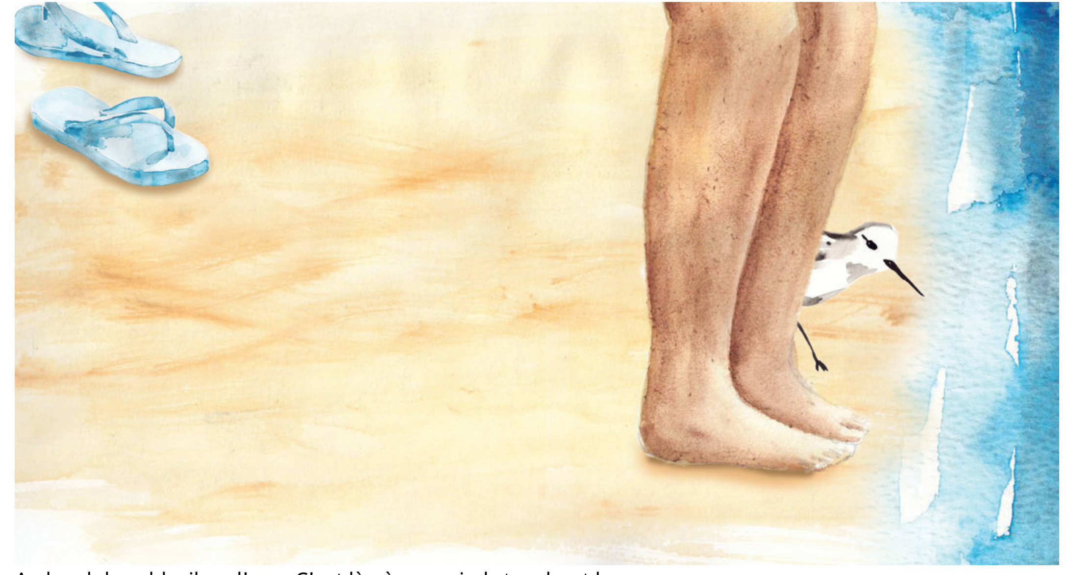
Au bord du sable, il y a l'eau. C'est là où mes pieds touchent la mer.