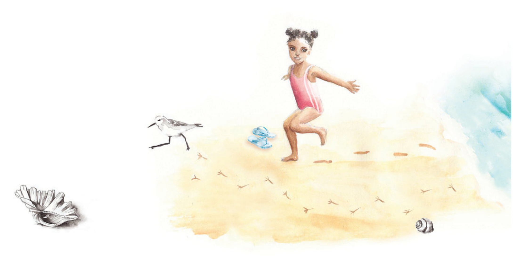
Les vagues jouent à un jeu. Elles disent oui, et moi je dis non. Elles courent après moi, voulant me dire bonjour, et je cours pour m'échapper d'elles.