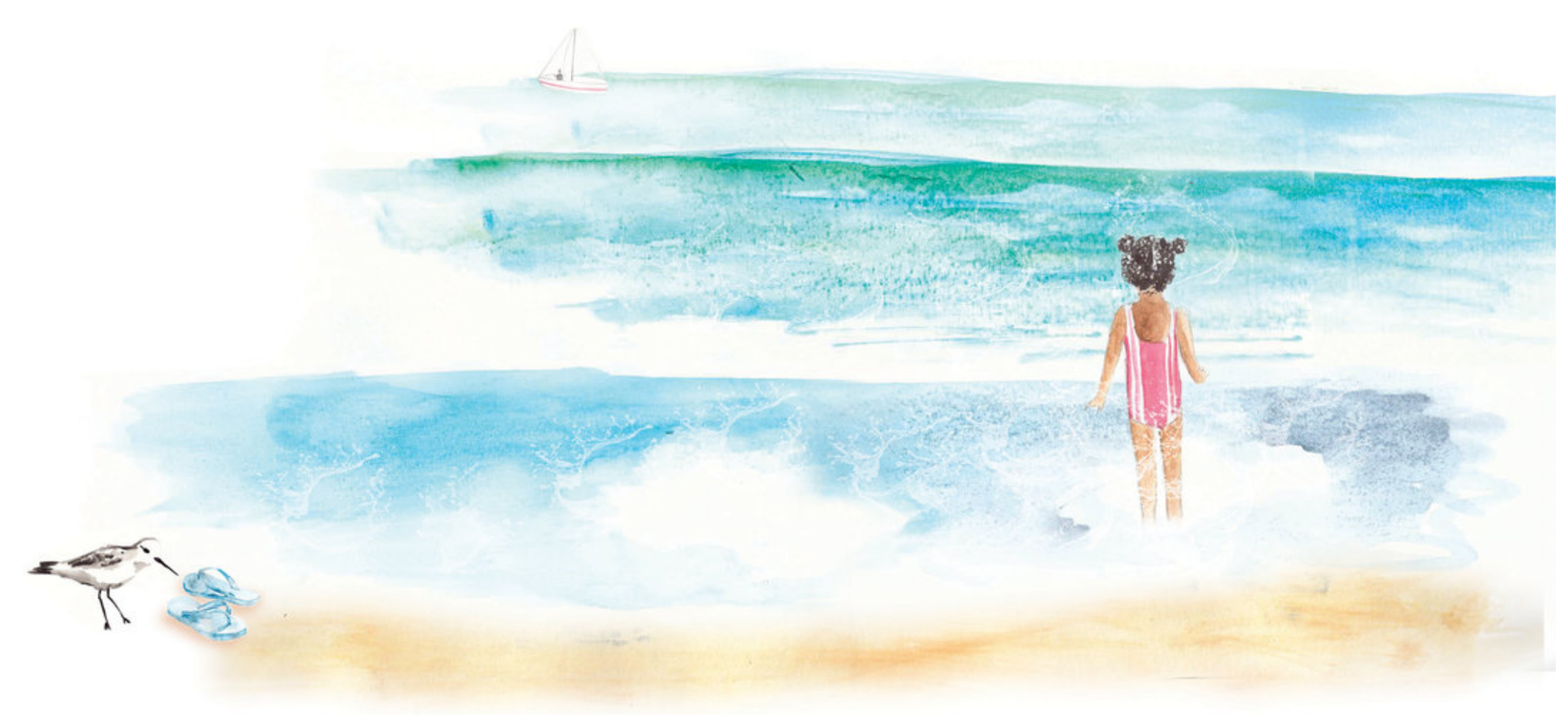
La mer et le sable courent sur mes pieds.