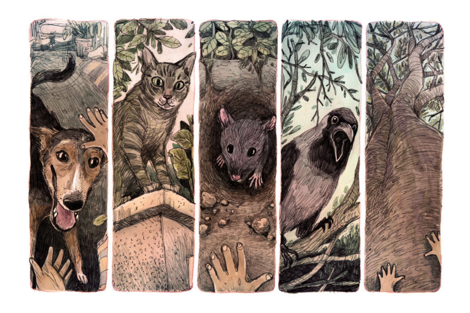
à un chien, un chat, un rat, une corneille, un arbre.