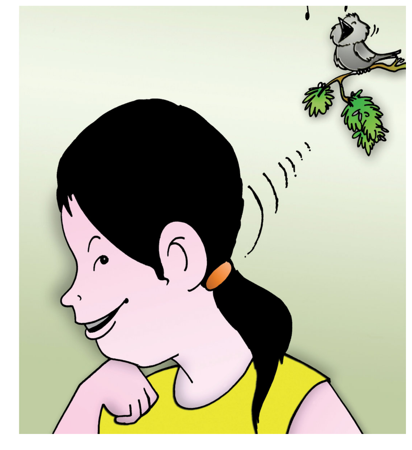
L'oiseau chante une belle mélodie. Je peux l'entend avec mes oreilles.