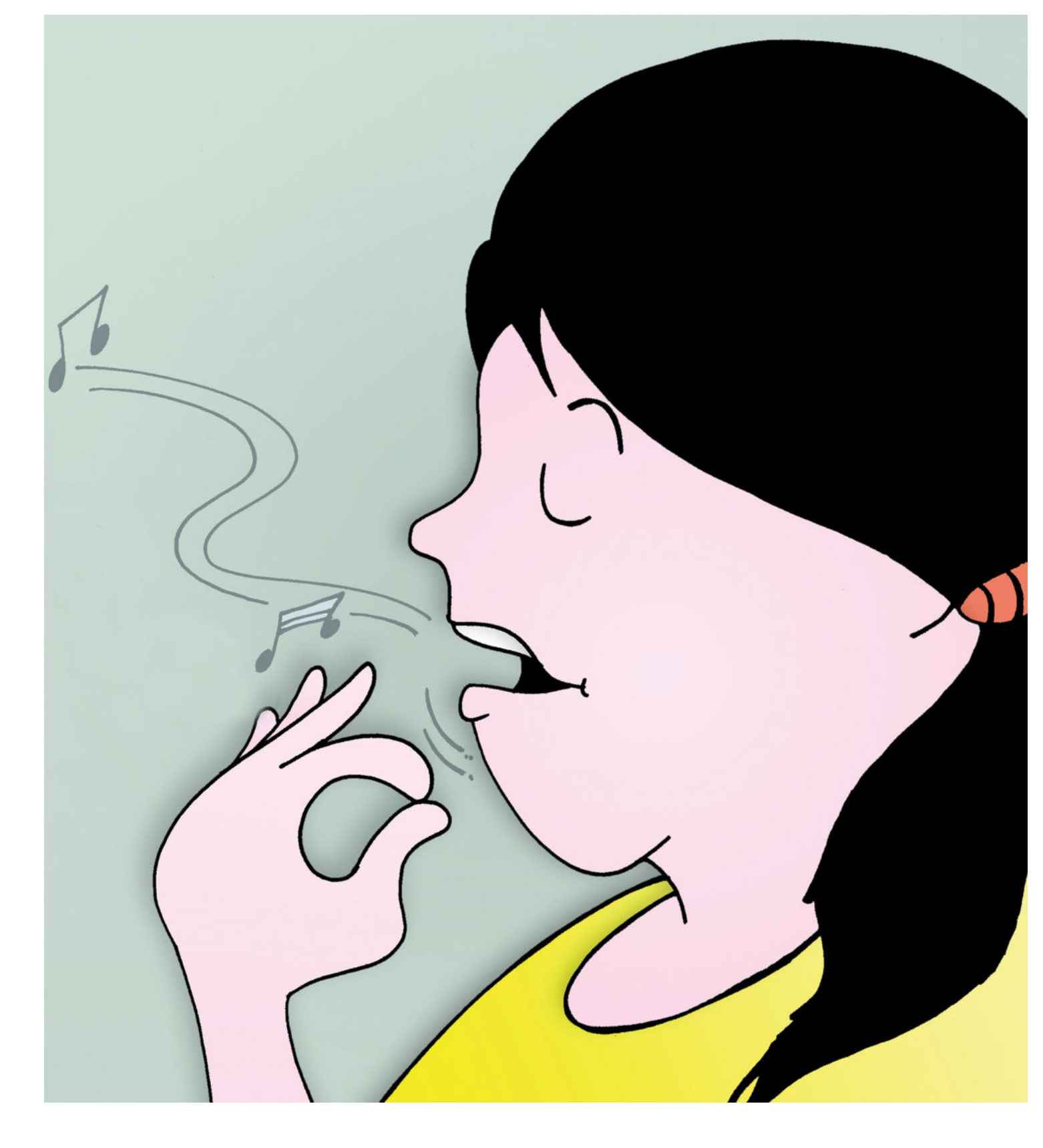
Je peux chanter. Je peux te chanter une chanson!