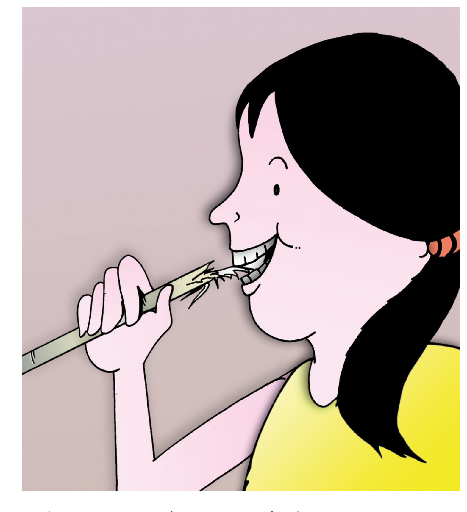
Ah! Cette canne à sucre est très dur, mais mes dents sont aussi fortes.