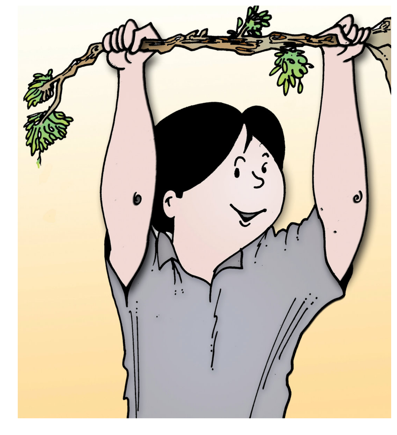
Je peux me balancer avec mes bras.