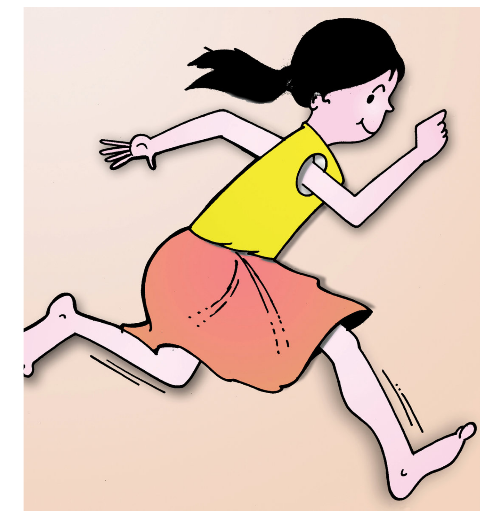
Mes jambes sont très fortes. Je peux courir vite.