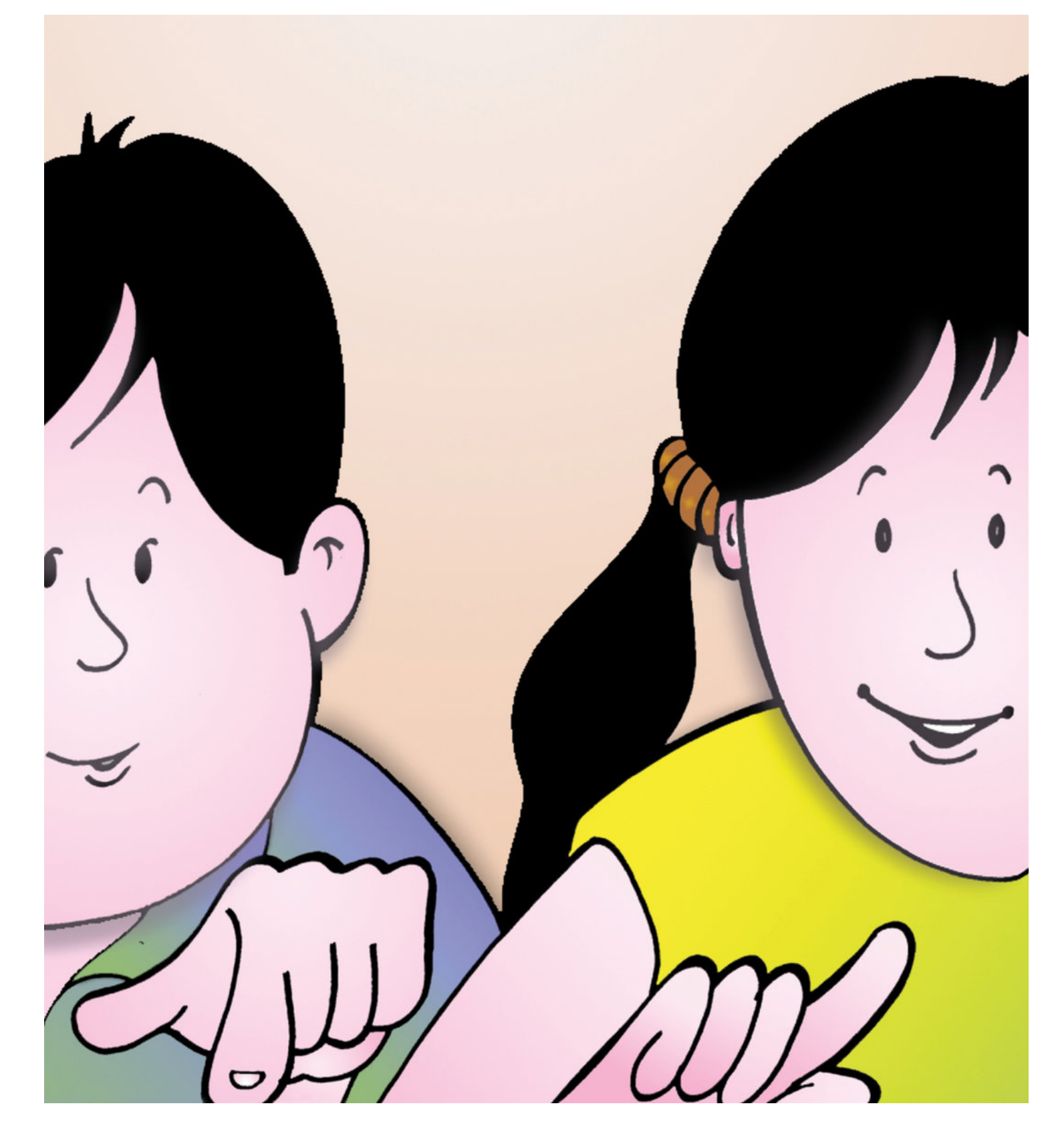
Bonjour! Voulez-vous être notre ami?