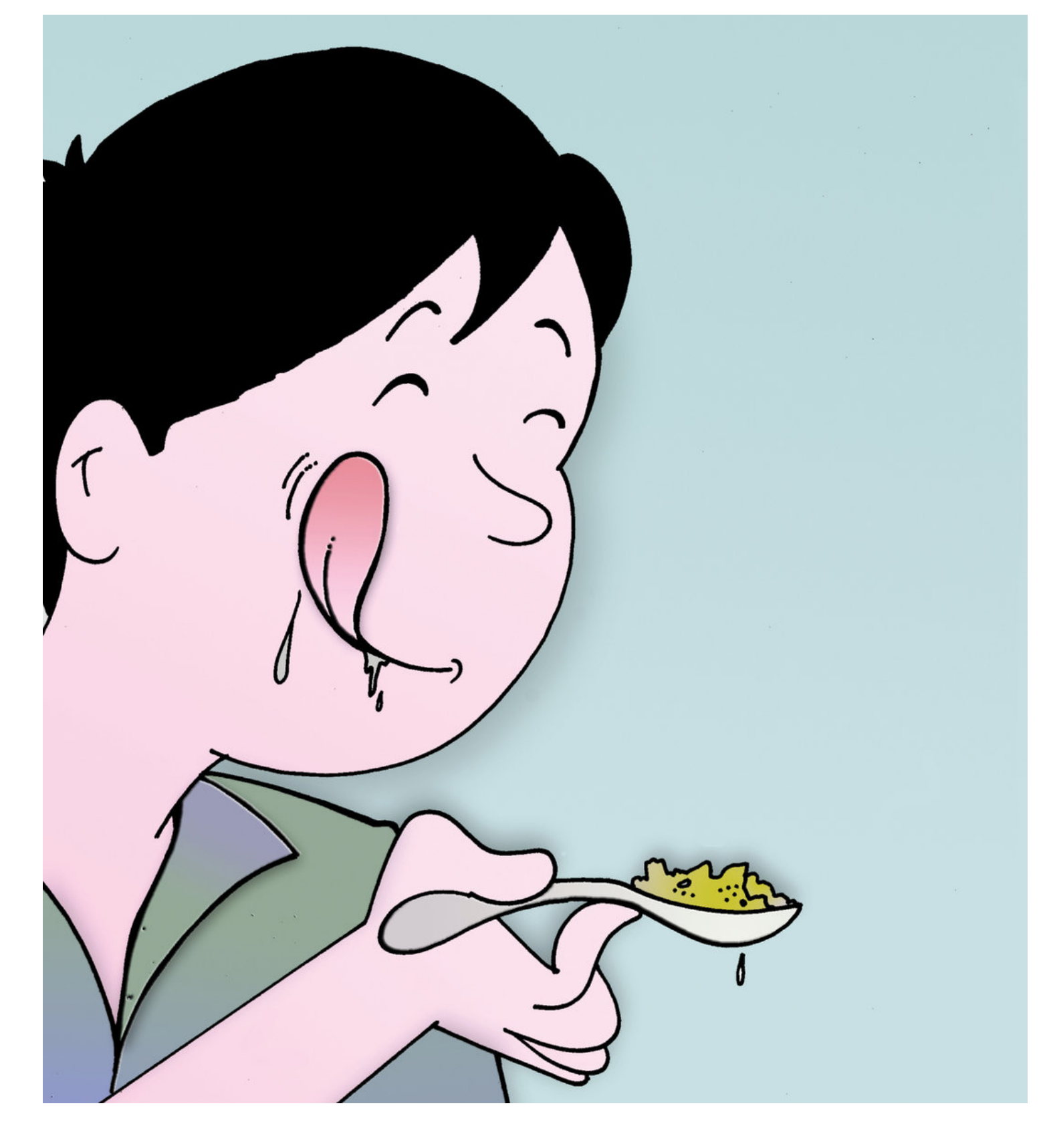
C'est très sucré. Ma langue m'a dit.