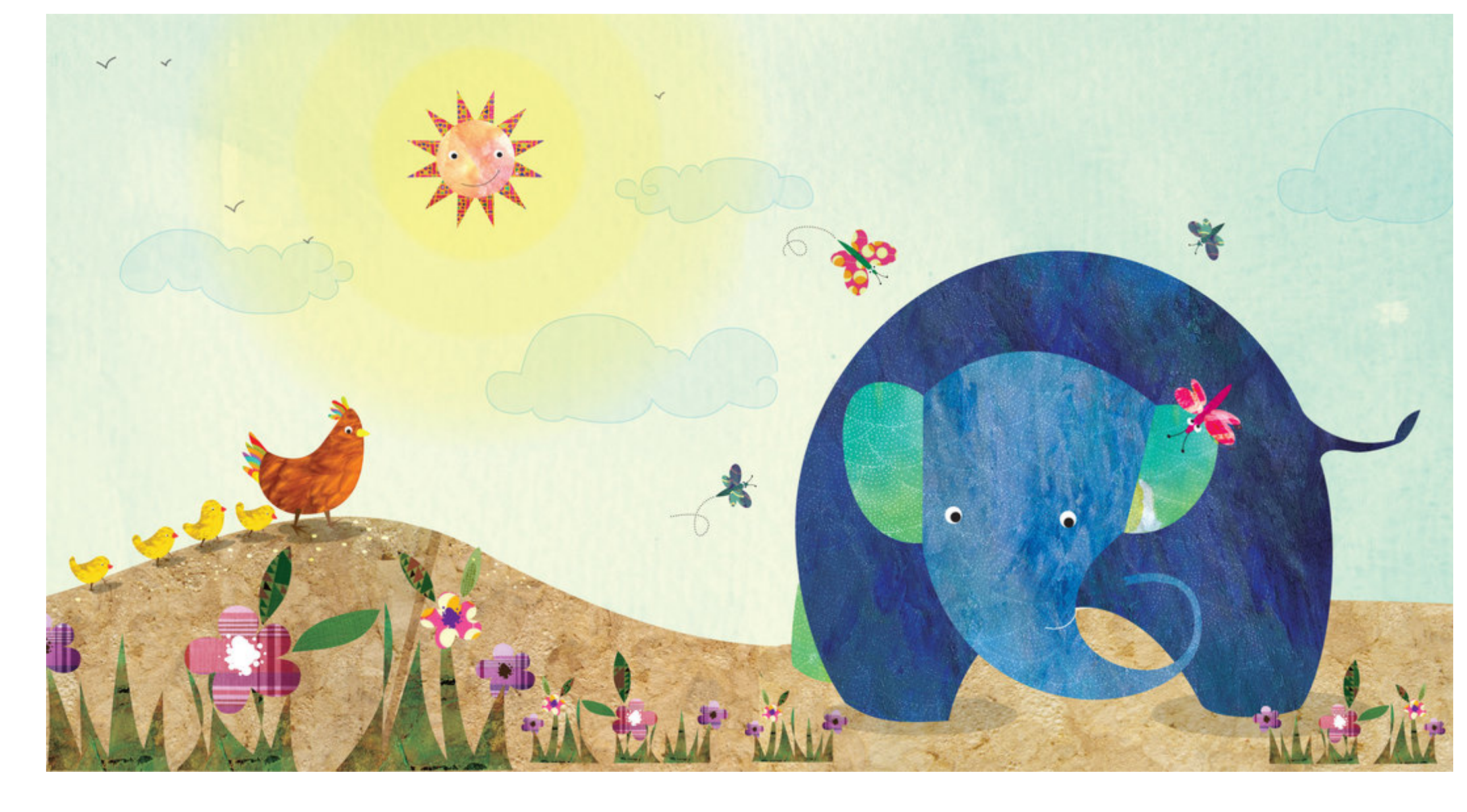
Ses oreilles font flap flap!