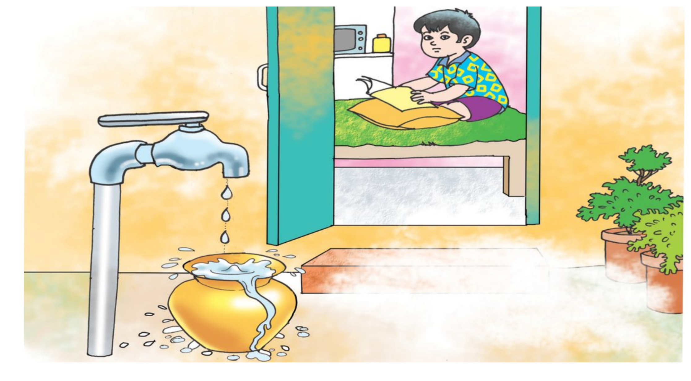
Ali a recommencé à étudier. Au bout d'un certain temps, le récipient fut rempli d'eau.