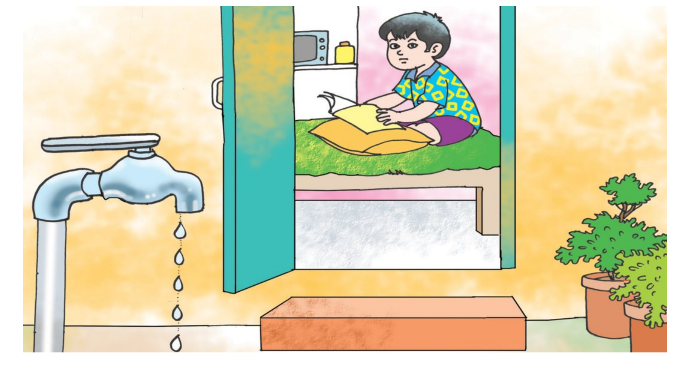
Soudain, il a observé le robinet de l'autre côté de la porte.