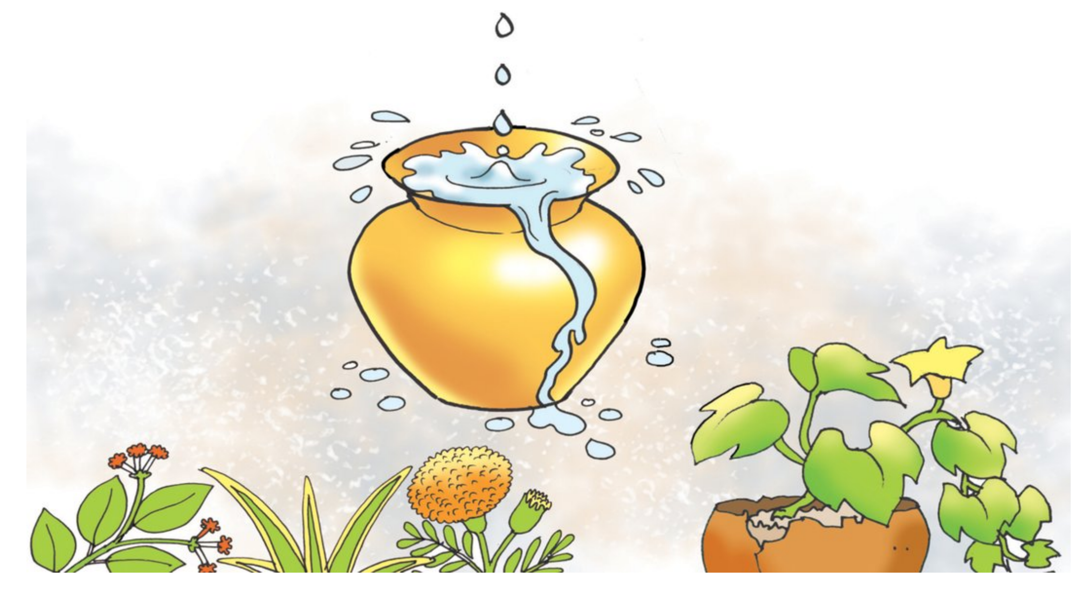
L'eau a alors commencé à couler dans le récipient.