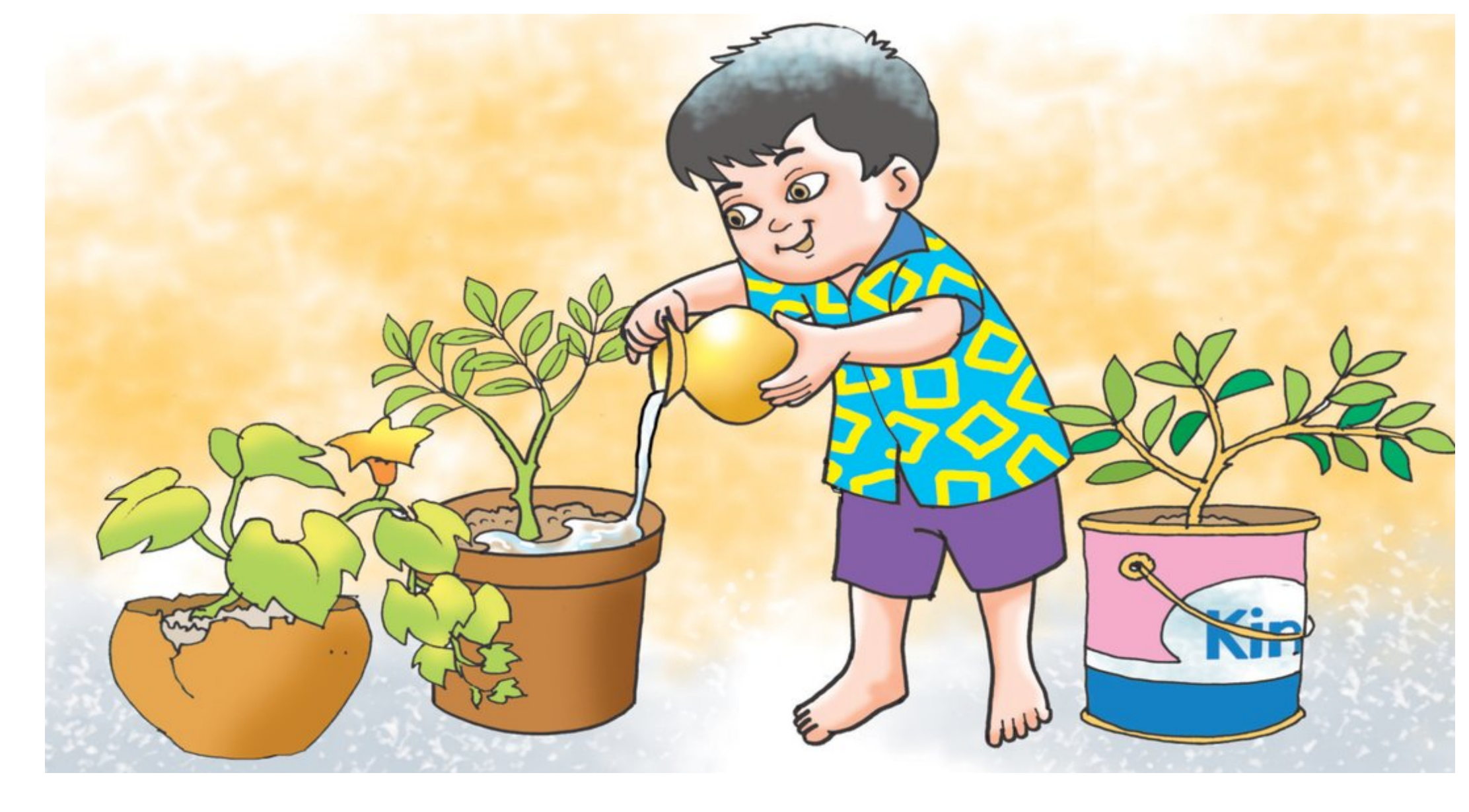
Ali a versé de l'eau du récipient dans les plantes.