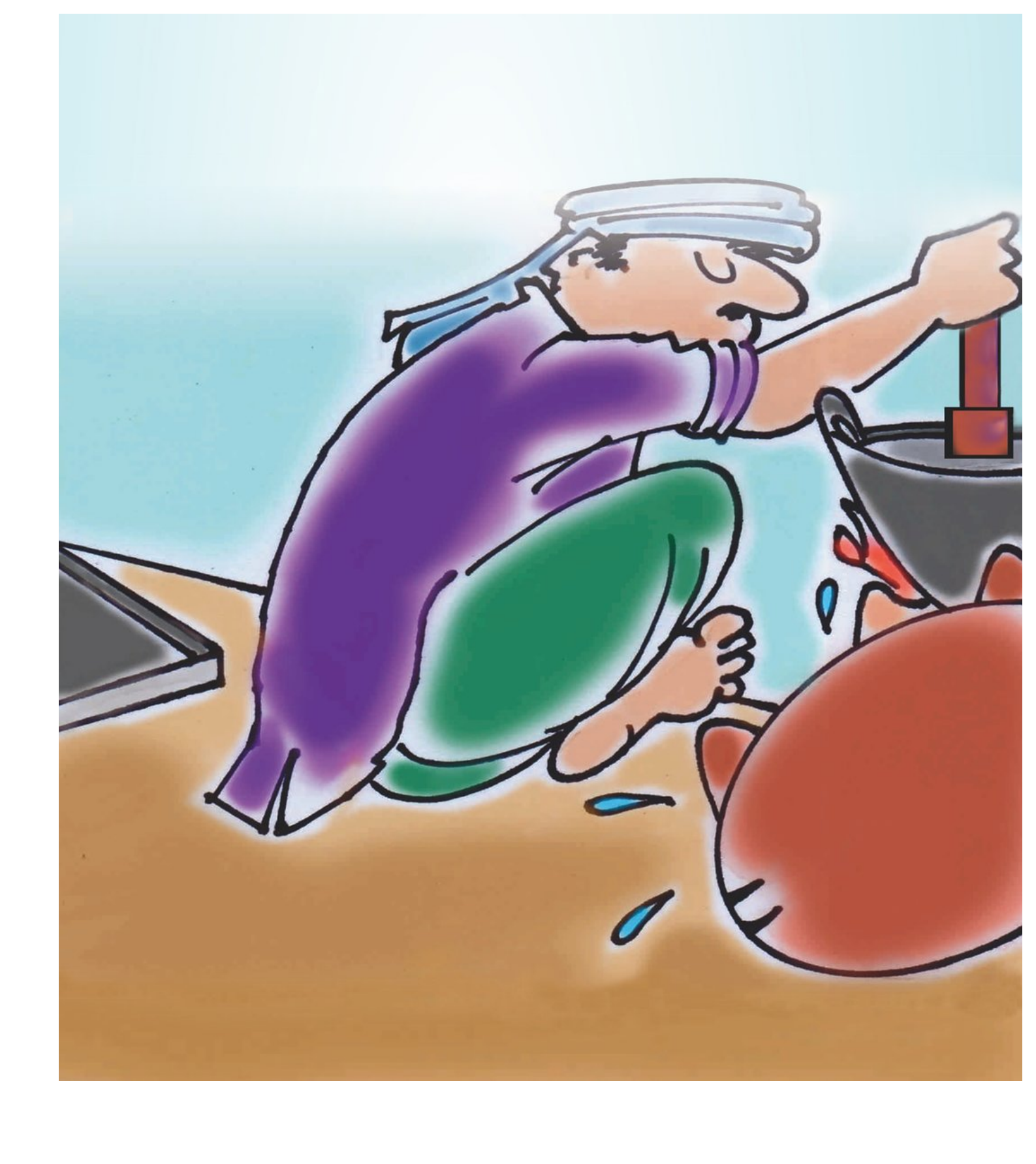
Le gros chat a vu un homme assis.