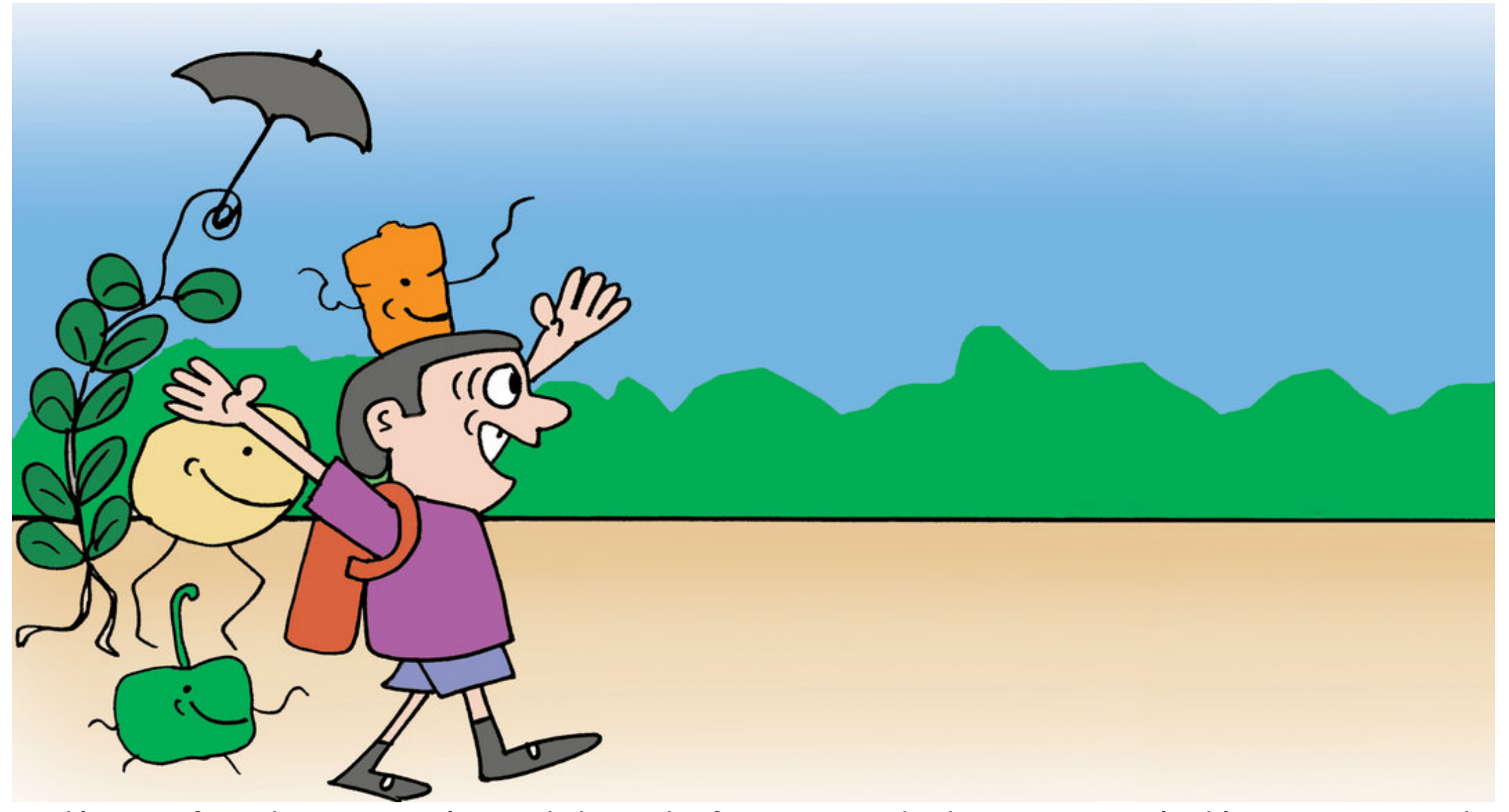
Les légumes firent la promesse à Raju de le rendre fort et costaud s'il en mangeait régulièrement. Lorsqu'il entendit ça, Raju fut tout content.