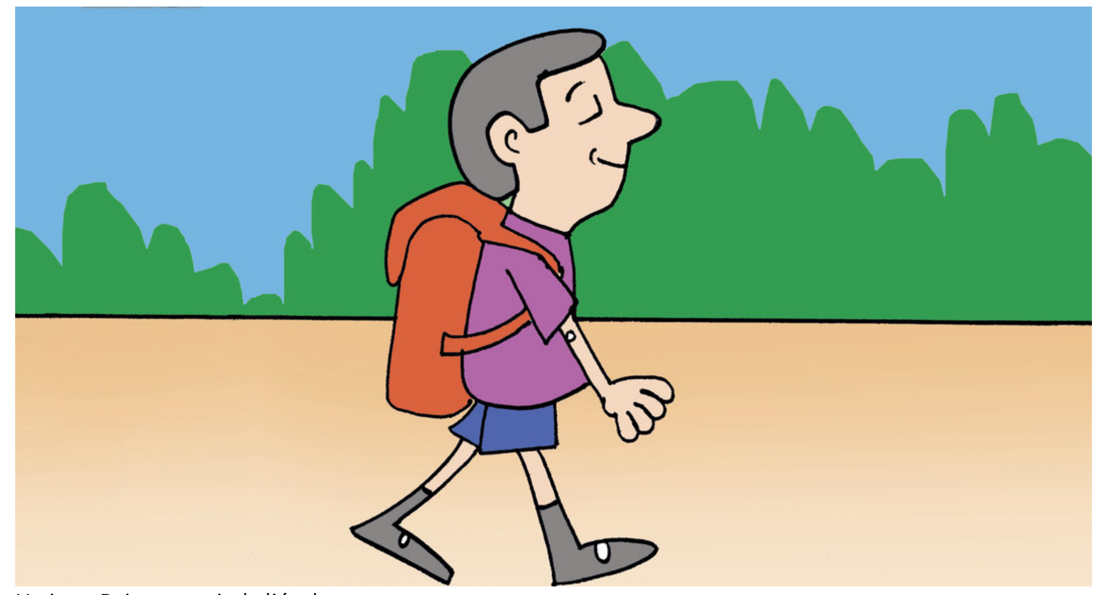
Un jour, Raju revenait de l'école.