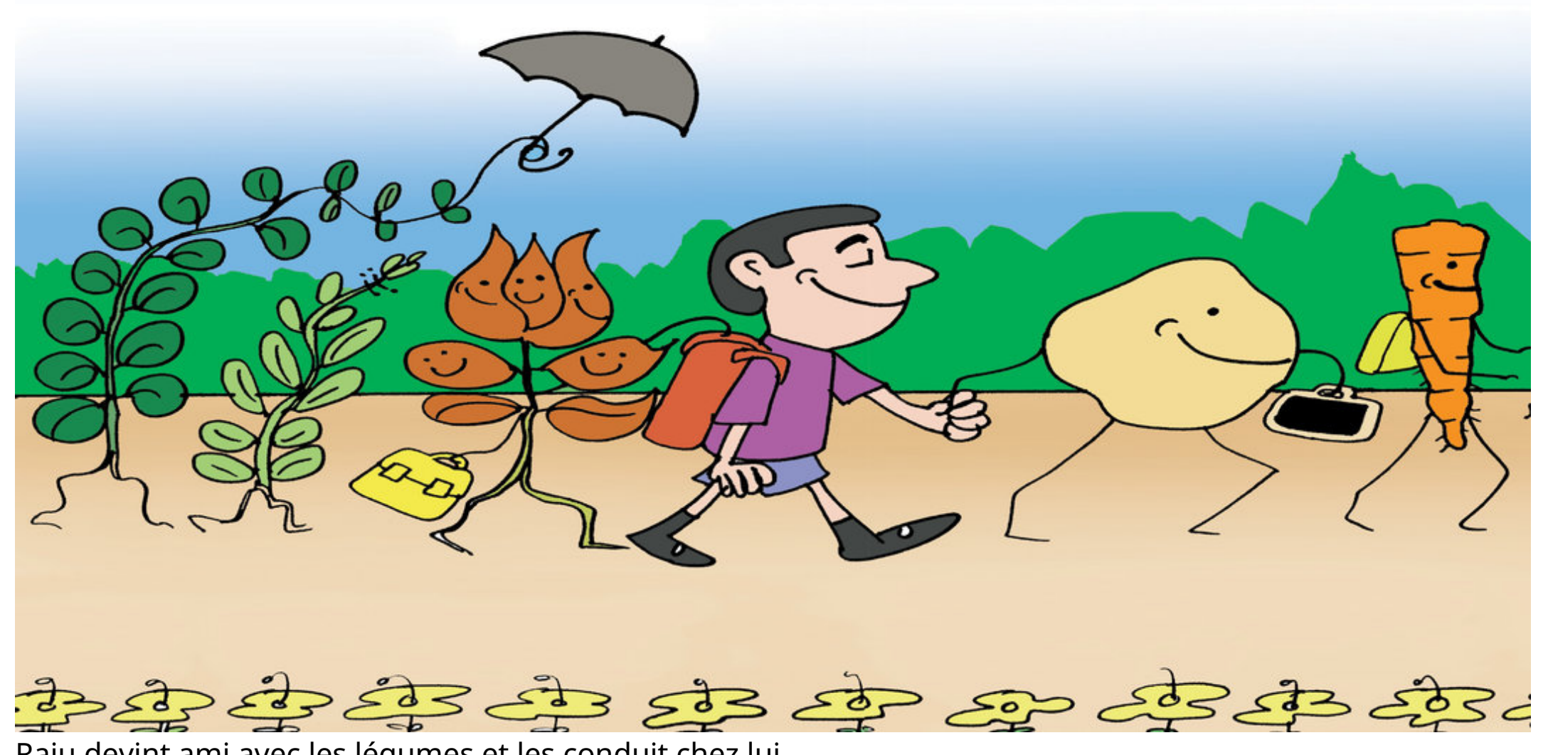
Raju devint ami avec les légumes et les conduit chez lui.