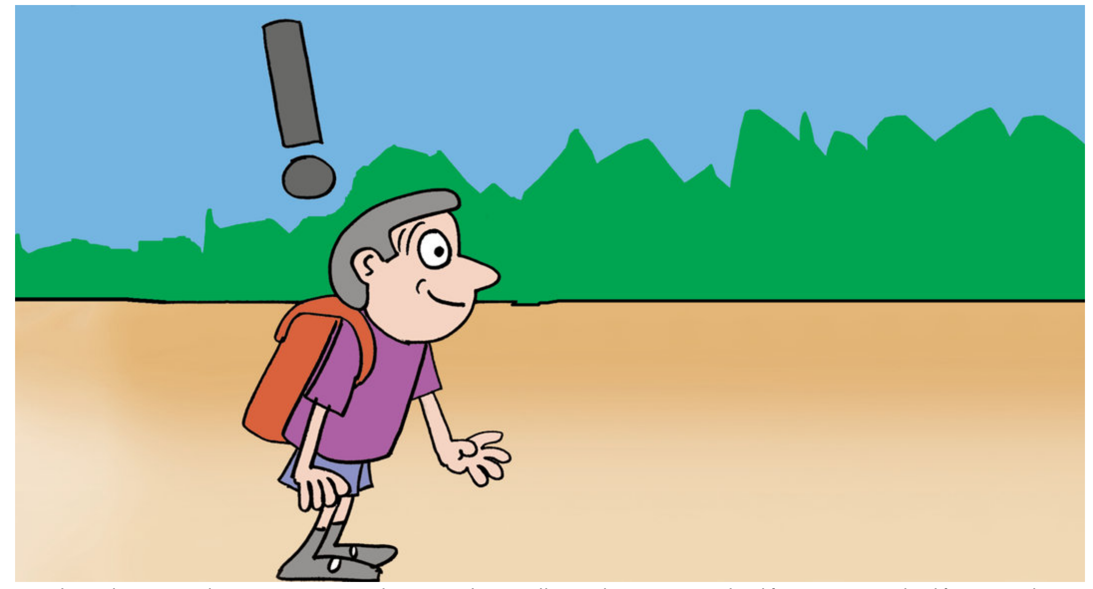
Soudain, il se rappela que sa maman lui avait dit qu'elle voulait cuisiner des légumes pour le déjeuner. Il se mit en colère car il n'aimait pas du tout les légumes.