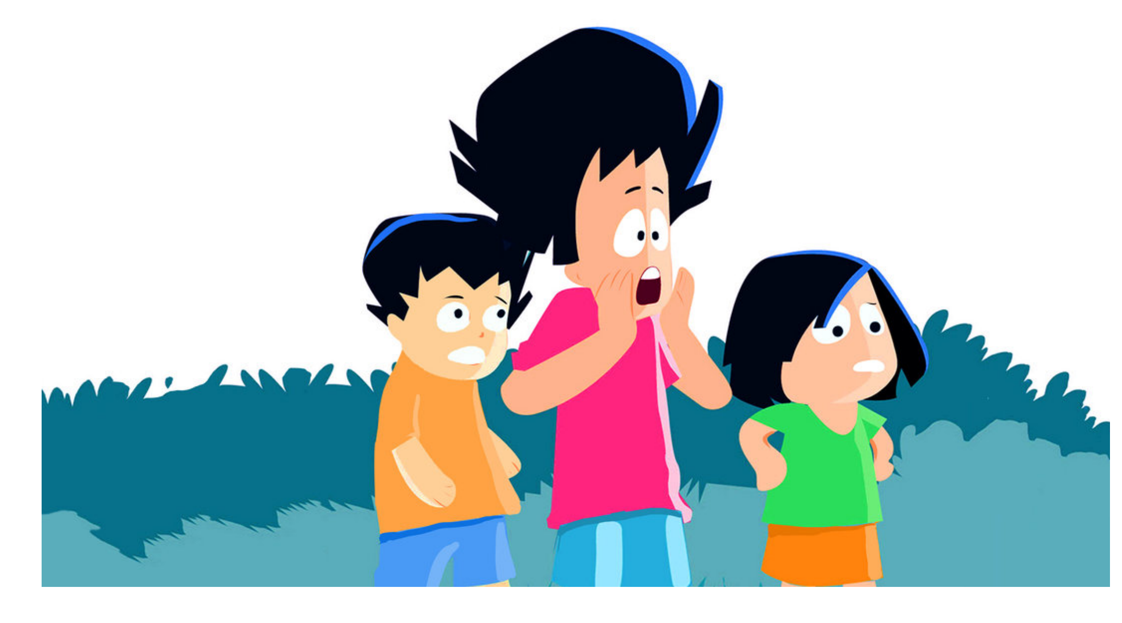
— Dépêche-toi, Jami! hurle Shaju.