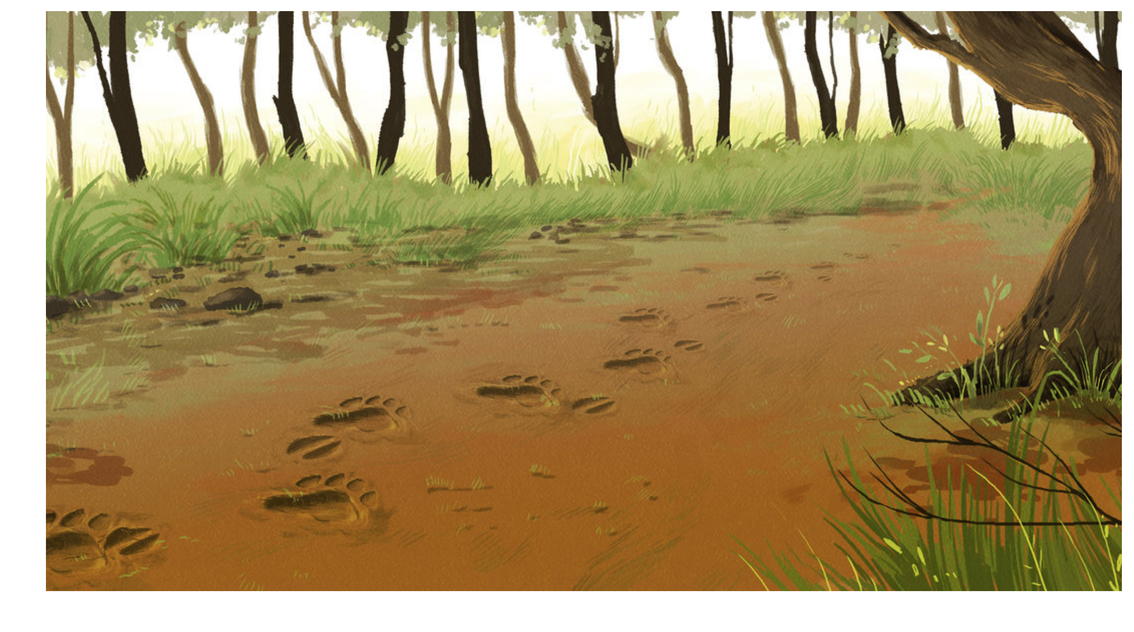
Qui vient de passer par là ?