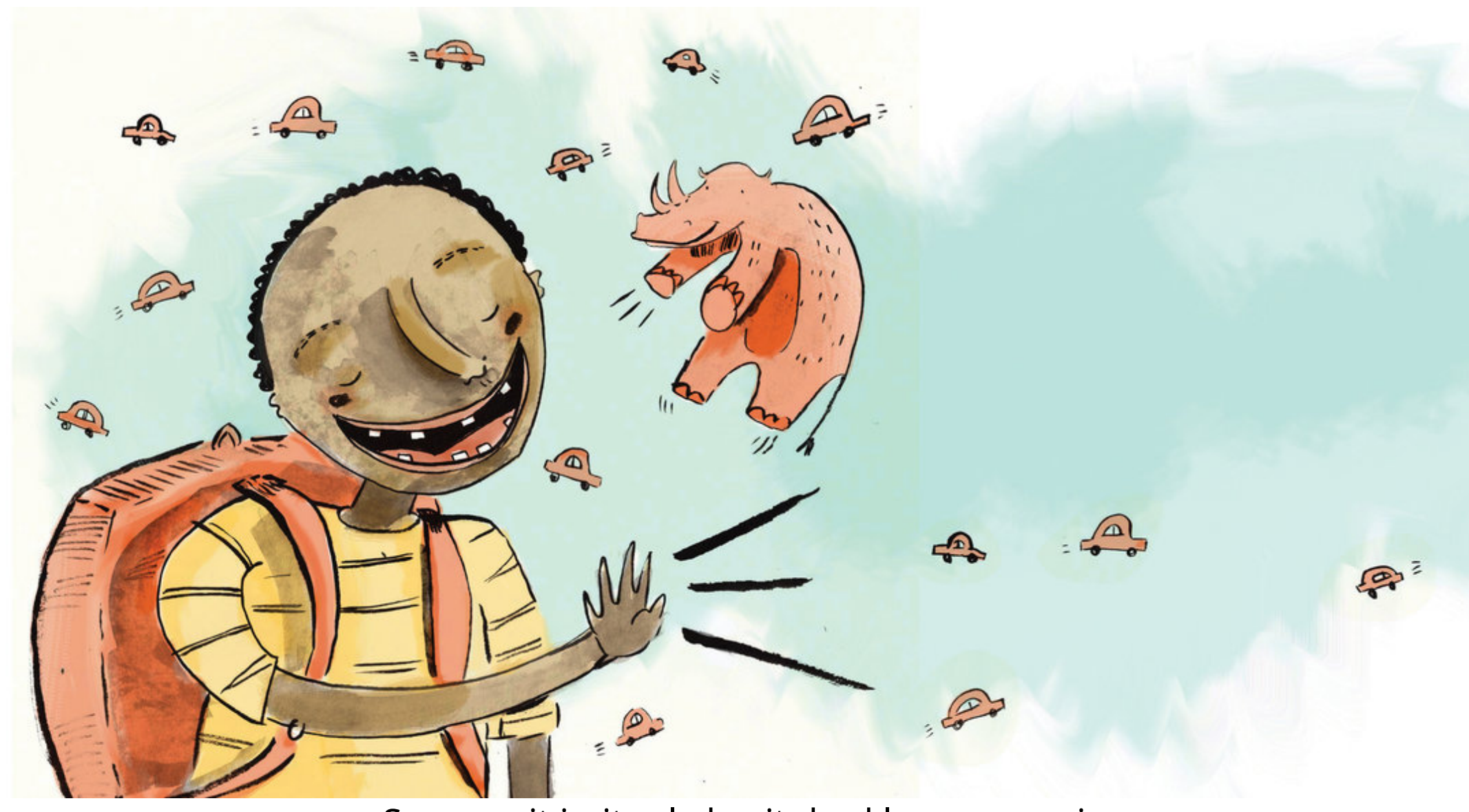
Senzo sait imiter le bruit des klaxons aussi.