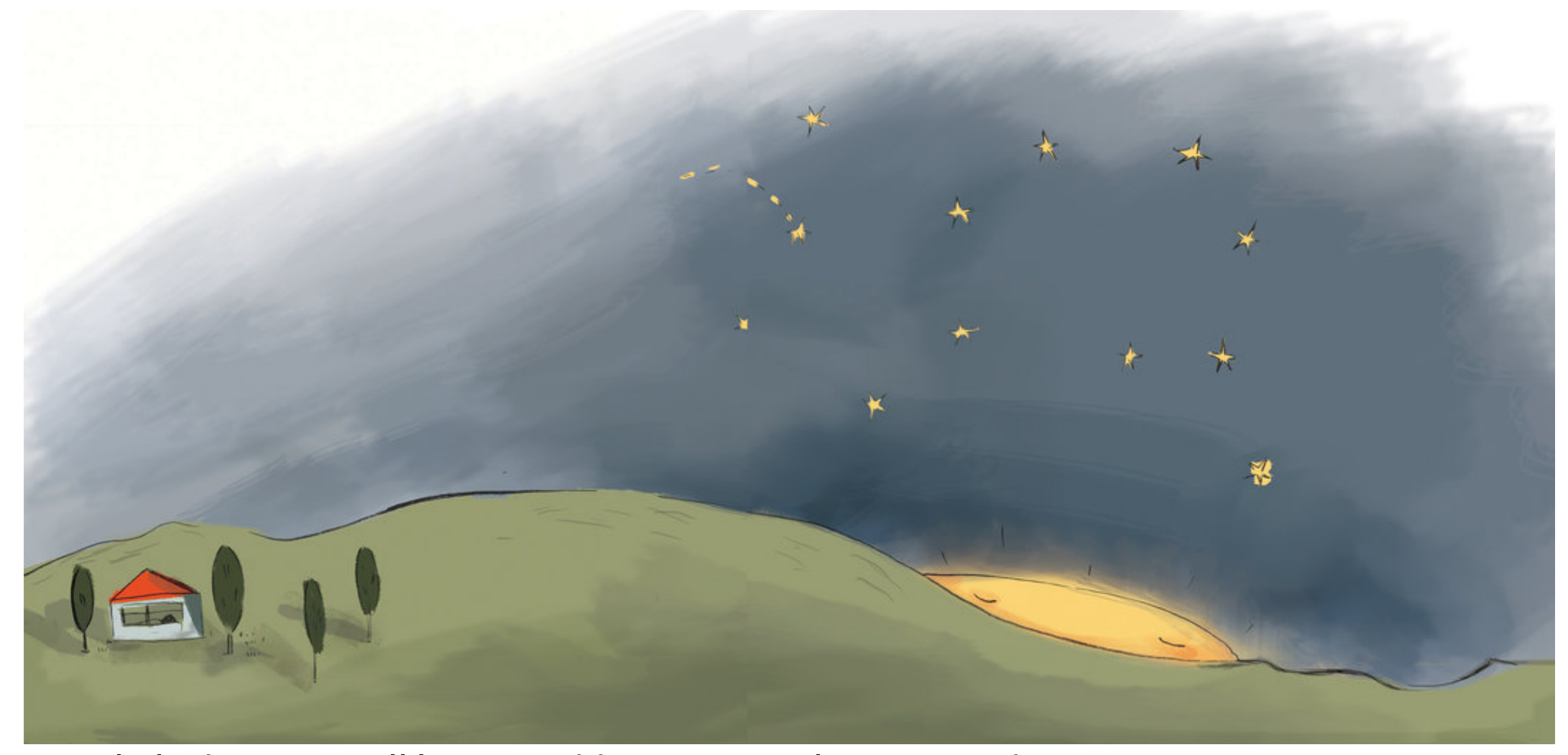
Le soleil a bien travaillé, aujourd'hui encore. Il va se coucher. Il se recouvre d'une cape d'obscurité pour se tenir chaud.