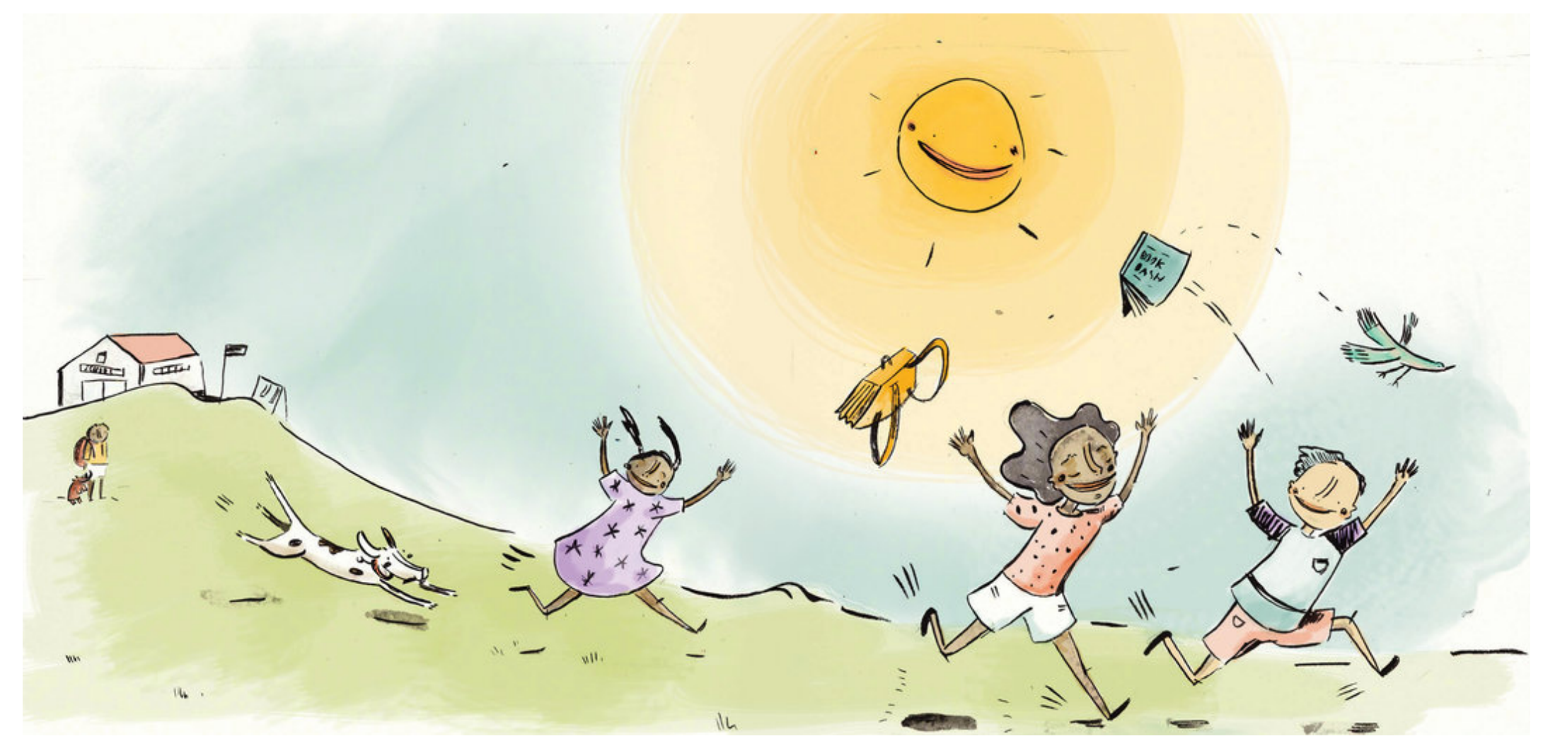
Le soleil est haut dans le ciel. L'école est finie et les amis de Senzo jouent dans l'herbe. Bras écartés, ils dévalent la colline en courant.