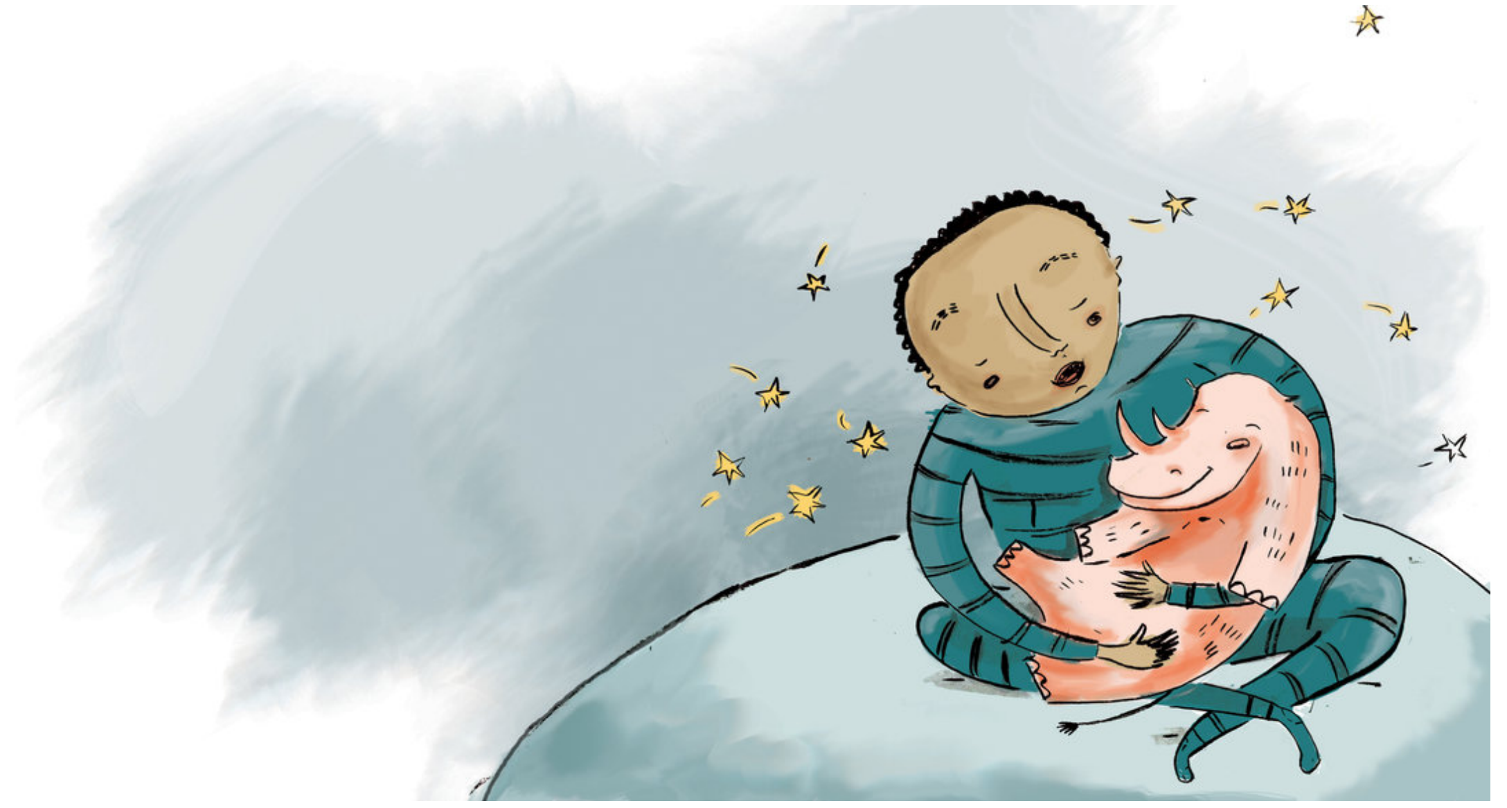
Senzo sait dire chut aussi.