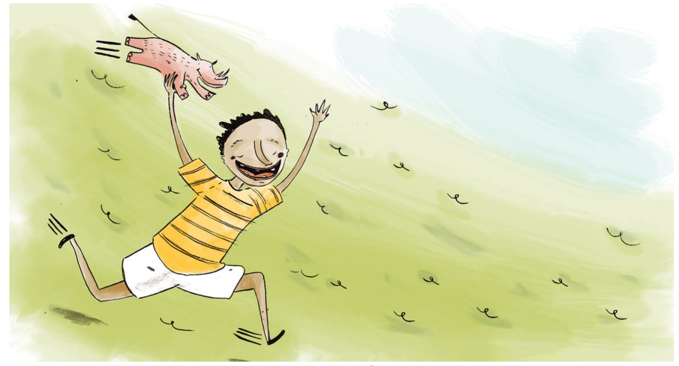
Senzo court très vite.