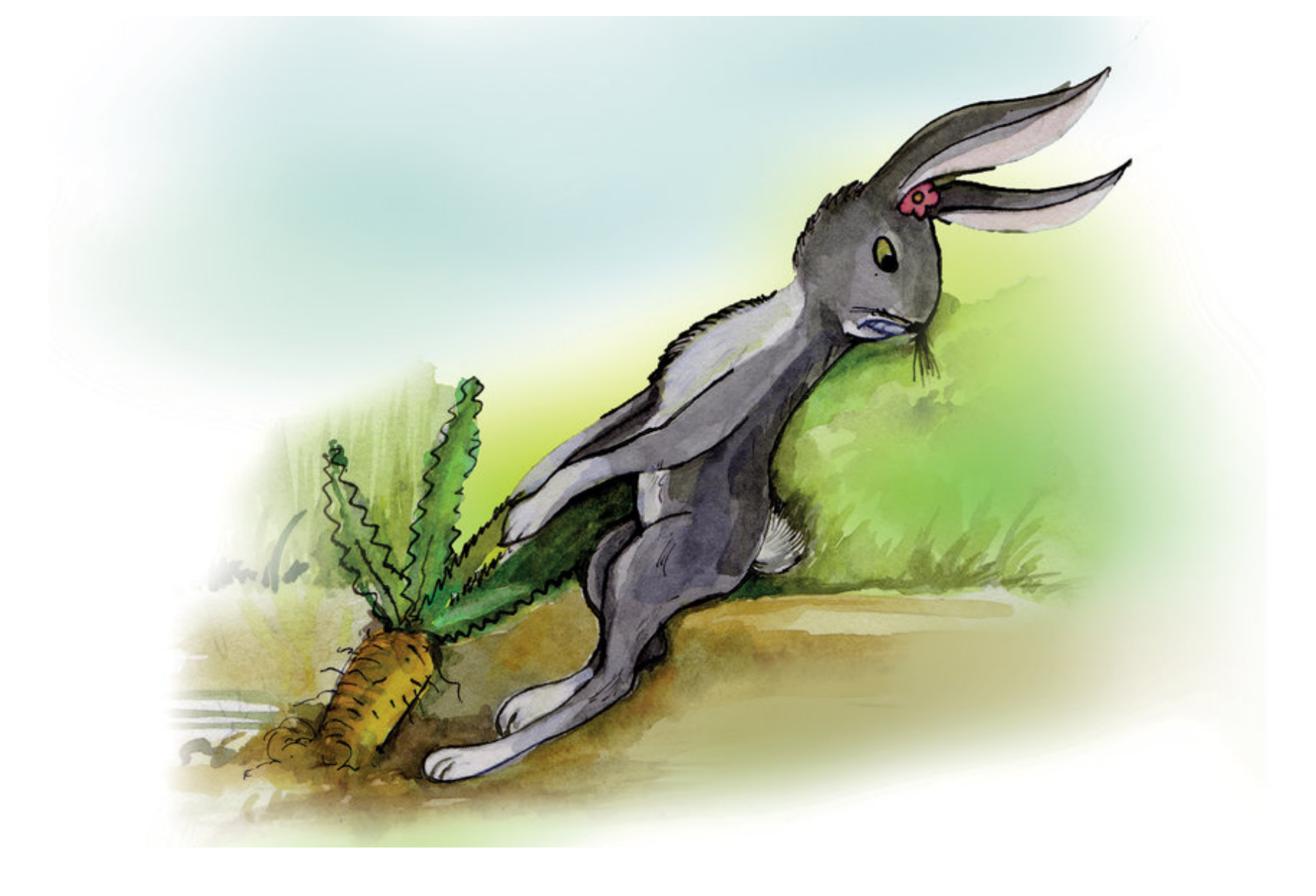
Je mange des carottes crues tous les jours, se dit Madame Lapin